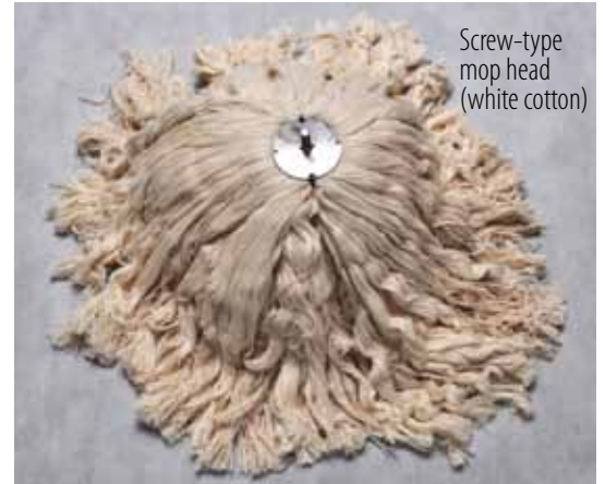
Screw-type mop head (white cotton)