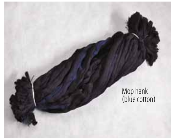
Mop hank (blue cotton)